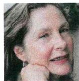
Sandra Paivio Emotion Focused Therapy