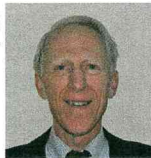
Howard Kirschenbaum Carl Rogers' Biographer